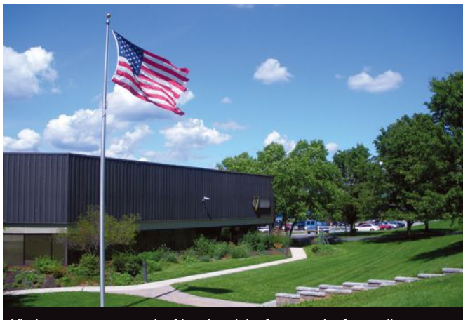
Viwinco now gets much of its electricity from a solar farm adjacent to its manufacturing facility.

General information: Celebrating its 30-year anniversary in 2012, Viwinco is family-owned business operating a 140,000-square-foot manufacturing plant, together with a 30,000-square-foot research and